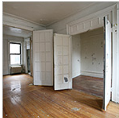
For the Right Price, the Right Fixer-Upper