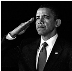
A Final Verdict on the Presidential Salute