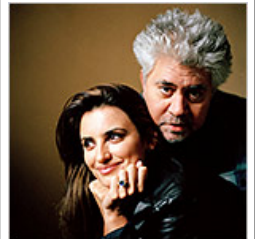
Cruz and Almodóvar: Cinematic Soul Mates