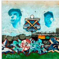
Warming to the Yankees: A Story of Betrayal